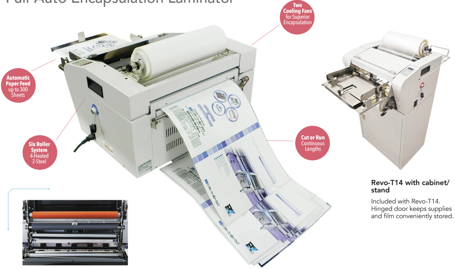
Revo-T14 with cabinet/stand

Included with Revo-T14. Hinged door keeps supplies and film conveniently stored.