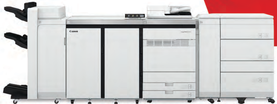
imagePRESS V1000 shown with optional accessories.