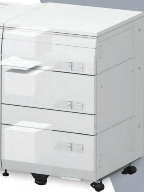
imagePRESS V1000 shown with optional accessories.